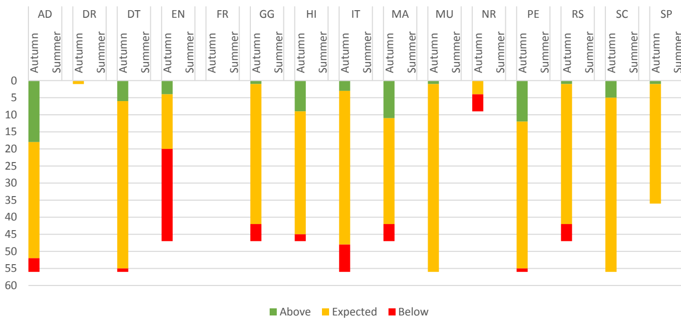
Effort by subject in Y7, term on term