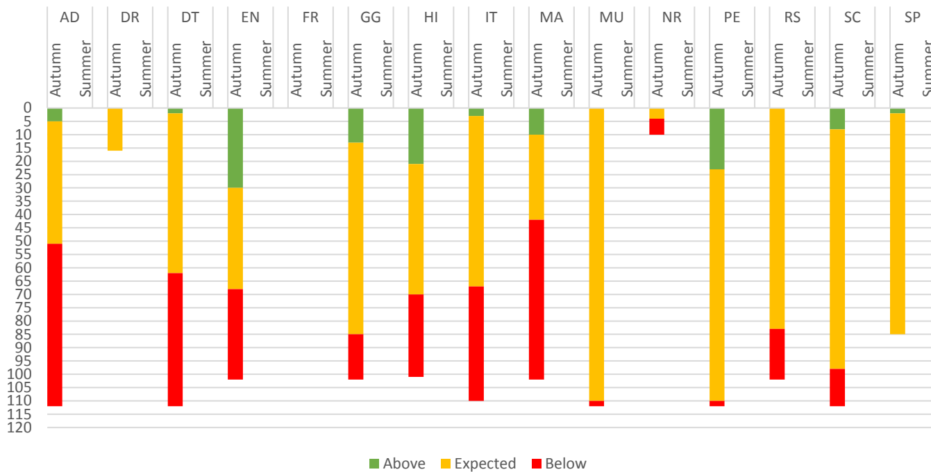
Number in Y7 making expected progress in each subject, term on term