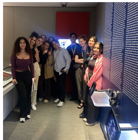
Photo above: With the Magna Carta Photo left: With 'The King's Library', once owned by King George III